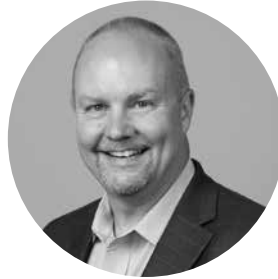
GARY HAHN PLAZA BMW