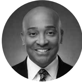
MALCOLM GAGE PLAZA INFINITI