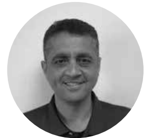
IBRAHIM YOUSEF KOONS BUICK GMC WOODBRIDGE