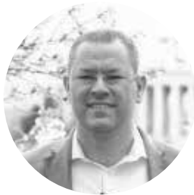
JAD KADILI KOONS WOODBRIDGE FORD