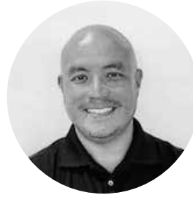
TRE HILLERICH KOONS FORD STERLING