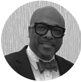
ANTHONY ALBURY NALLEY HYUNDAI

PARTS & SERVICE GROSS PROFIT -GREATEST % GROWTH; CUSTOMER PAY RO COUNT -GREATEST % GROWTH - IMPORT