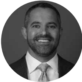
CHARLES OWEN PARK PLACE LEXUS GRAPEVINE ELITE OF LEXUS