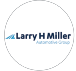
LARRY H. MILLER LEXUS MURRAY ELITE OF LEXUS