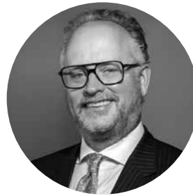
WILLIAM JOHNSON III STEVINSON LEXUS OF LAKEWOOD