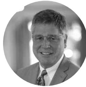
WAYNE WATKINS COGGIN BUICK-GMC OF ORANGE PARK MARK OF EXCELLENCE