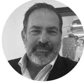
TIMOTHY WOOD MERCEDES-BENZ OF CHESTERFIELD