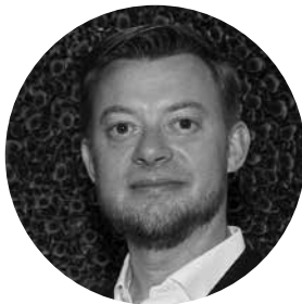
ZACK KELLEY COURTESY TOYOTA OF BRANDON