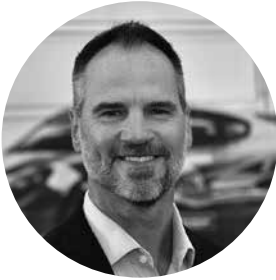
MIKE BOYD LAND ROVER PORSCHE VOLVO OF GREENVILLE