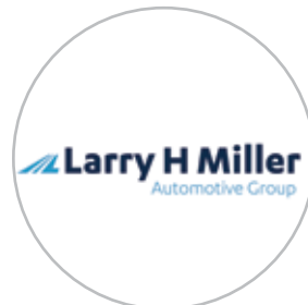
LARRY H. MILLER LEXUS OF LINDON ELITE OF LEXUS