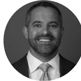
CHARLES OWEN PARK PLACE LEXUS GRAPEVINE