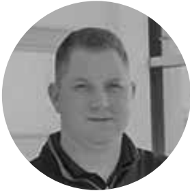
RAYMOND BALDWIN KOONS CHEVROLET BUICK GMC CLARKSVILLE MARK OF EXCELLENCE