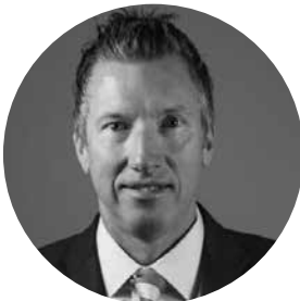
DONNY LAMBRECHT PARK PLACE VOLVO CARS