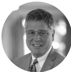
WAYNE WATKINS COGGIN BUICK-GMC OF ORANGE PARK